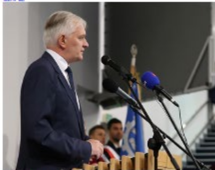
Compliance with mandatory rules during an epidemic

Author: Thomas Hapke Publication: 2021-02-04 00:54:34 Update: 2021-03-02 13:05:50 02/04/2021